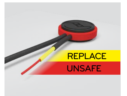
For more information peakdesignItd.com/tips