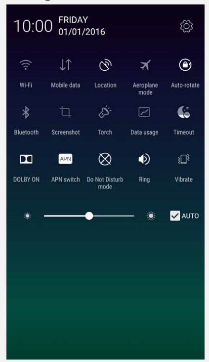
Figure 2: Quick Settings