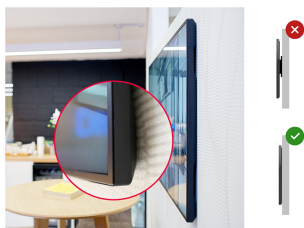
Zero-Gap Wall Mount

Designed to perform in continual, around the clock environments, the LH6570UHB can be installed and utilised in landscape and portrait orientation. The jaw dropping and best-in-class 35mm total depth (when used with the included proprietary brackets) will mean this display can be installed discretely and elegantly in all areas.