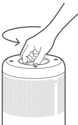
Removing the Old Filter

Turn the purifier upside down, and rotate the filter counterclockwise to remove it.