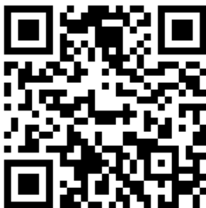
Aplication QR code

Green Teardrop: Clicking on the green teardrop sends a request to the watch for immediate localization. The result will be available in a few seconds.