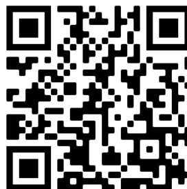
QR kód for video manual