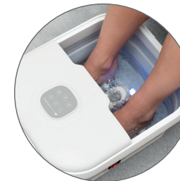
6 Reflexology rollers