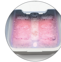
Powerful 500W heater