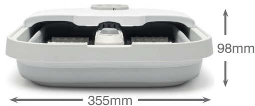
Folds Flat for easy storage