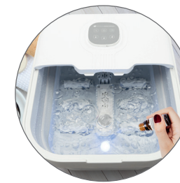
Use with essential oils