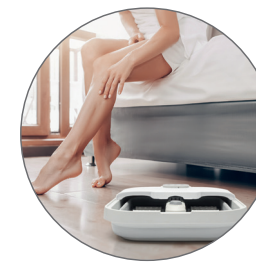
Compact space-saving design