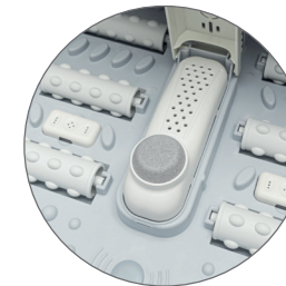
Pedicure pumice stone tool