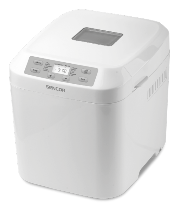
EN • Breadmaker