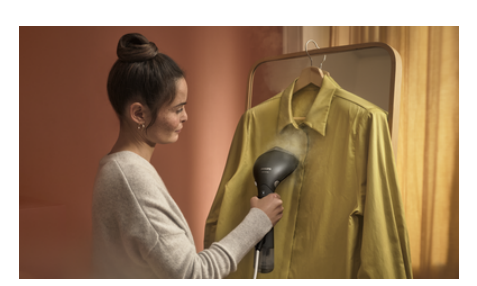
7000 Series has a compact design making it the perfect on-the-go solution to steam your clothes anytime, anywhere. No ironing board needed.