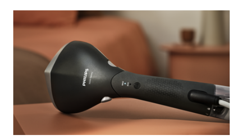
2 steam settings: ECO mode to save water without compromising on steaming results, MAX mode to provide more steam power.