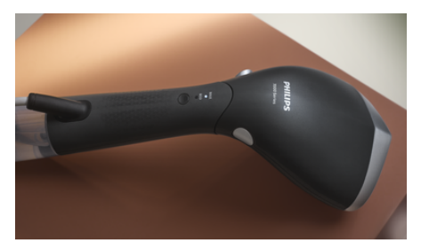
Whenever you need it, your steamer is ready to use in just 30 seconds. The light indicates when you are ready to start so you're finished in notime. Ideal forthose last minute outfit decisions.