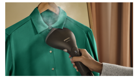
The steam plate features a pointed tip so you can easily smooth creases with extra precision in hard-to-reach areas like buttons, collars and pleats.