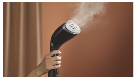
Up to 28 g/min of continuous powerful steam relaxes fabric fibres so creases can be smoothed quickly, ensuring your garments look their best.