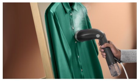
The innovative adjustable head means you can smooth creases at any angle, giving you the option to steam vertically or horizontally - whichever you choose!