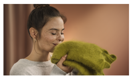
Besides de-wrinkling, 7000 Series also refreshes clothes (and soft furnishings, curtains, toys) and removes odors by killing up to 99.9% of bacteria*.