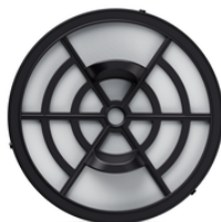
Washable motor filter

The kit contains 1x washable motor filter. This provides high filtration levels and prevents fine dust from reaching the motor and damaging it. The filter can be washed.