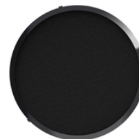
Washable foam filter

The kit contains x 1 washable foam inlay filter. This filter is providing additional protection to the motor and should be placed next to the washable motor filter. The filter can be washed.