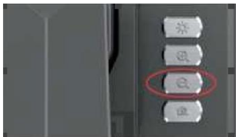
[Zoom out] button

Plug in power adapter, then press and hold the [Zoom out] button for around 3 seconds. Then you can see that TFT screen shows "Initializing...". Restore factory setting finishes when TFT screen shows "Initialized"